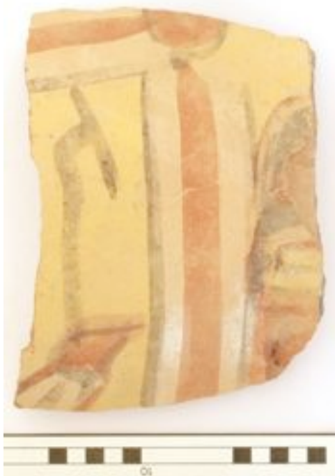
Fig.7: Fragment of the painted pottery coffin from the looted tomb shaft P021.

The majority of other finds were small broken pieces of faience, especially fragments of vessels, and unidentifiable pieces of worked stone. Despite there being no field walks a surprising number of rough clay figurines were recovered including 14 of the type known as 'woman on a bed' figures.