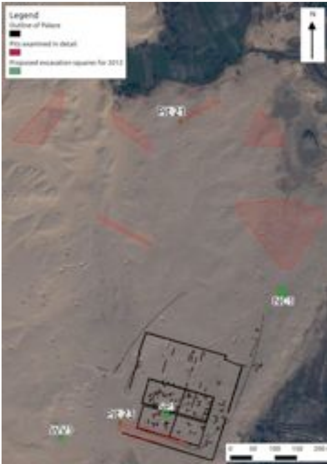
Fig.1: Satellite image of the site with superimposed plan of the settlement area and indications (red hatching) of the extent of illicit excavation in 2011, and looters' pits 21

mapping, topographical survey, pottery surface collection (in areas SP1, NC1 and WV1, see Fig.1), small finds collection, auger boring, and mapping and study of areas of illicit excavation (see red hatched areas and specifically Pits 21 and 23 in Fig.1).