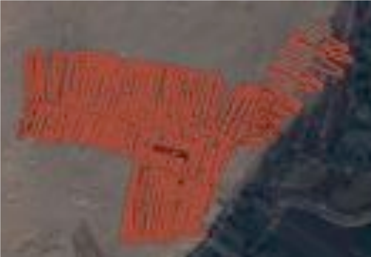
Fig.5: The satellite image of the southern part of the site, showing the quantity of individual points taken at about halfway through the season.

The aim of the topographic survey is to build a three-dimensional model of the topography of the site in GIS. The GIS uses an algorithm to interpolate the height of the ground between the individual points recorded in the survey, and so builds a model of the site. Later, information on the landscape around the site will be added to the model, which will also include the information on past ground levels and relict channels of the Bahr Yussef recorded during the drilling of geological boreholes around the site and across the area (see for instance Fig.?? below). The model can then be used to investigate the relationship between the modern landscape and the ancient environment.