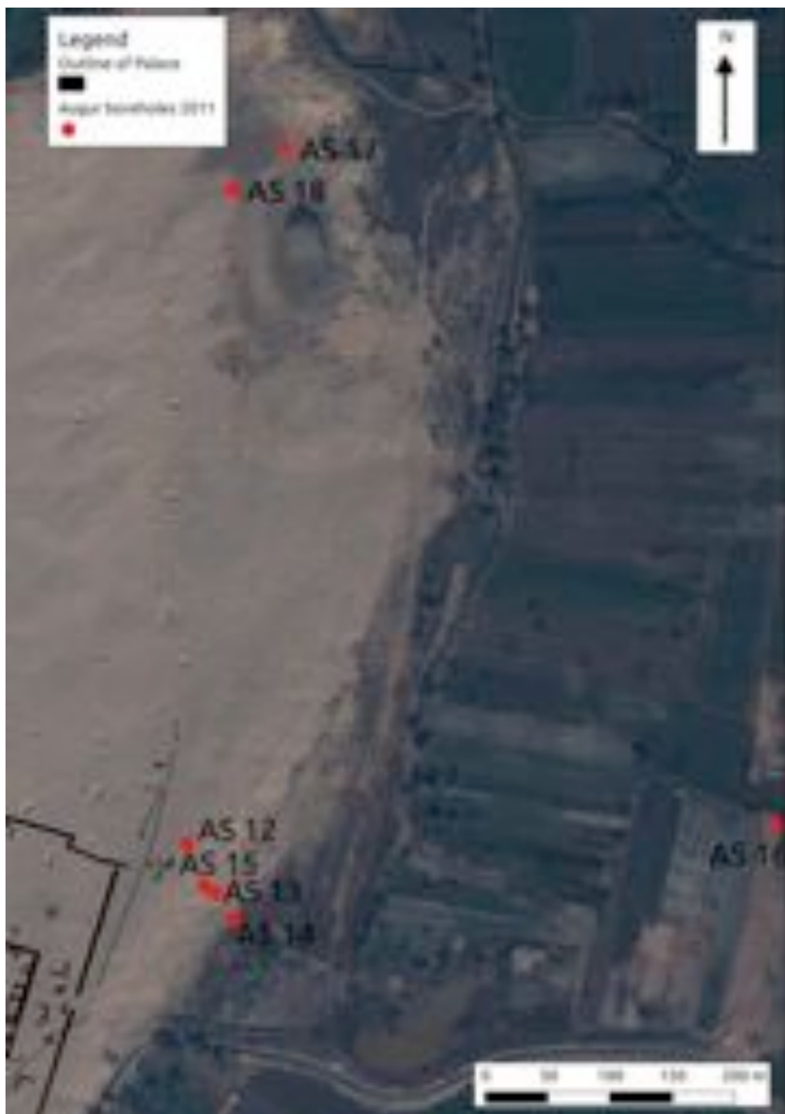
Figure 10. Satellite image of the site showing the locations of augers AS12-18.