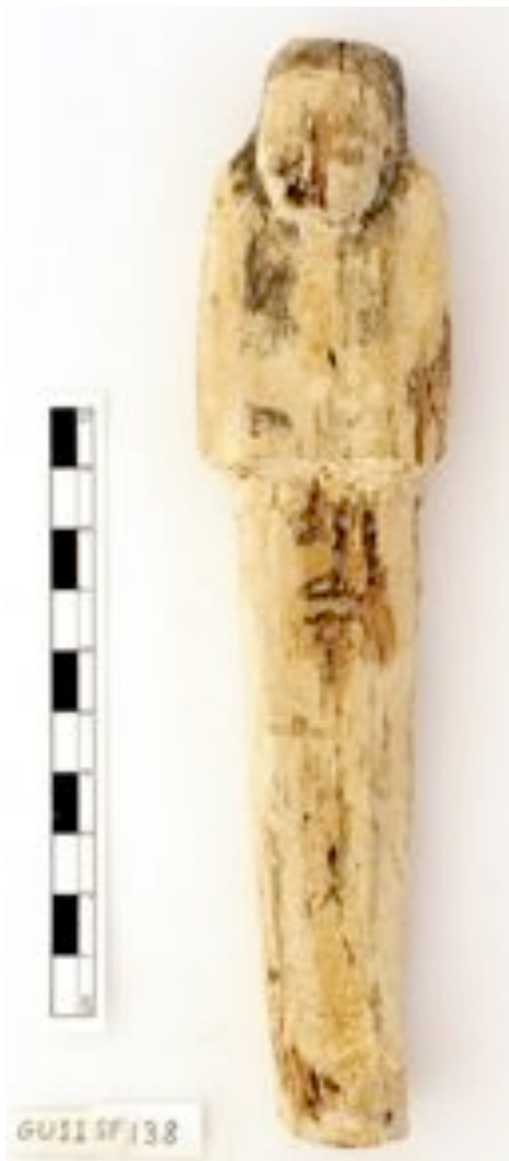
Fig.8: A painted wooden shabti from the looted tomb shaft P021.